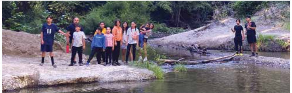
The group enjoyed splashing around in Pescadero Creek.

It started with a Camping 101 Workshop at Sports Basement a week before the camping trip. The kids and CCC staff had the opportunity to learn how to set up and break down their tents and try out a few sleeping pads. They learned about the three-bin washing system and how to set up and store a camping stove. They also learned about the principles of Leave No Trace Behind. As a bonus, they got to try dehydrated food. At first, the kids thought it looked yucky, but once they ate the chicken and rice, they wanted more. Overall, it was a fun interactive experience for the group which was about to go camping for the first time.