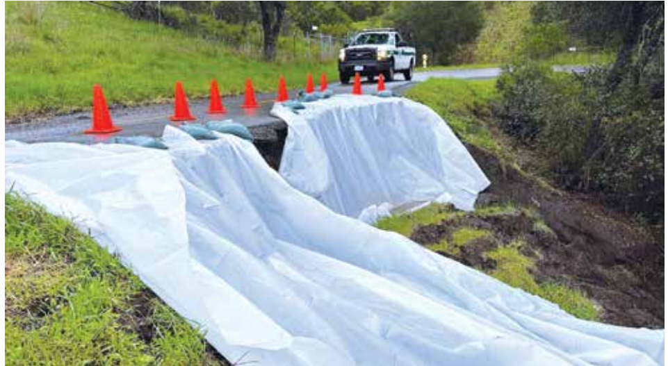
Damage at 1.7-mile mark of Sawyer Camp Trail.

While our storms stopped months ago, the damage was spread throughout the county and kept San Mateo County Parks