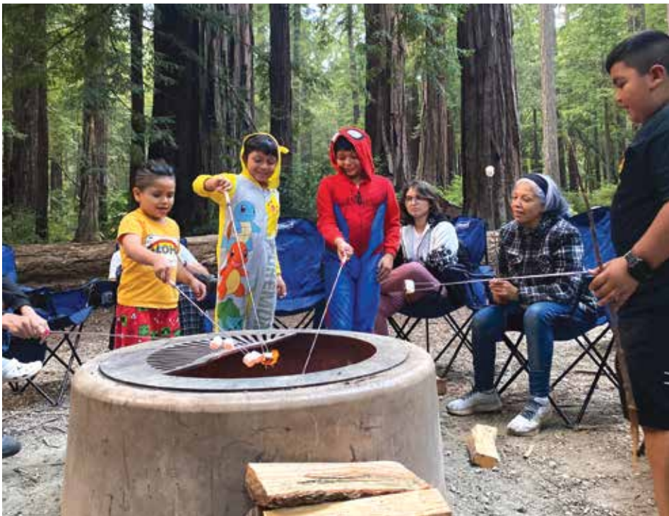
Kids, cartoon characters and superheroes alike were all hungry for s'mores!