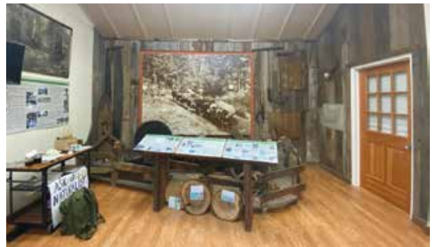
Top: The windows in the Nature Center bring the redwoods inside. Above: Memorial Park's Nature Center is ready for its makeover! You can help make that happen.