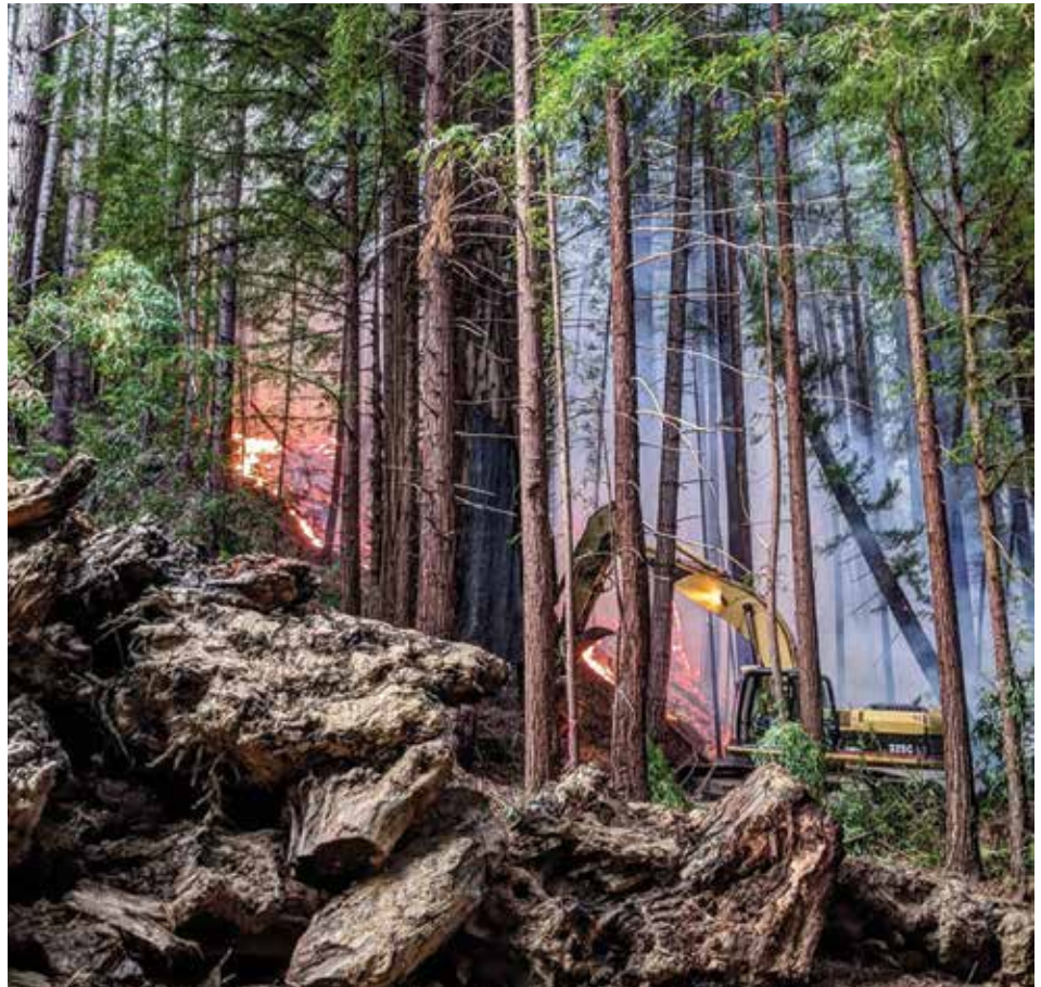
A San Mateo County Park Ranger operates a masticator to create a fuel break.

Surely, if 2020 is one thing, it is the year of seeing clearly. Climate change is real. Ignoring it doesn't mean it will ignore us. Forest health is critical. We would do well to honor and acknowl-