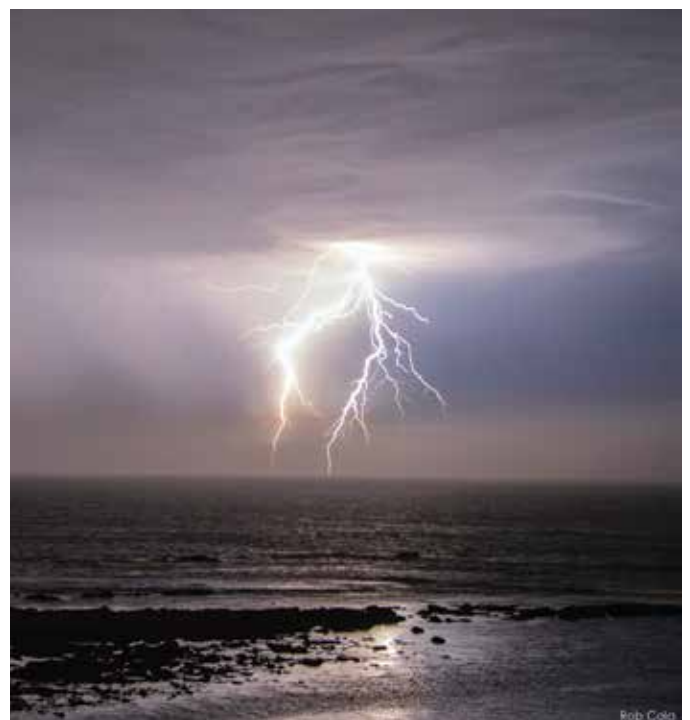
Lightning strikes over the ocean