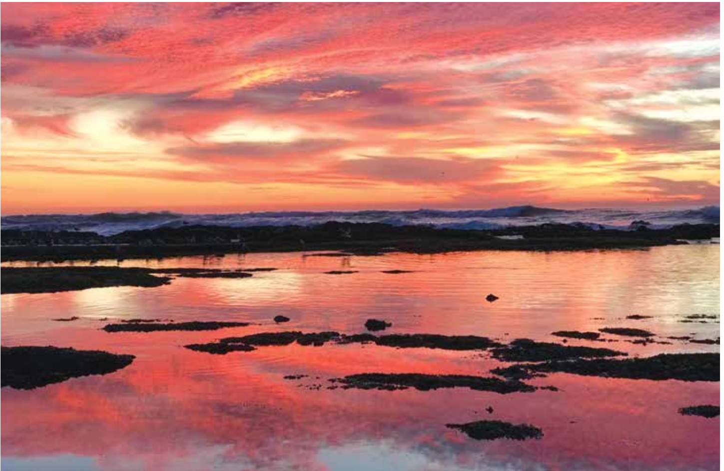
Gorgeous sunset over Fitzgerald Marine Reserve