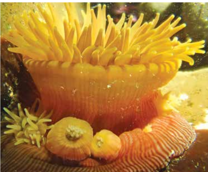
Brooding sea anemone babies