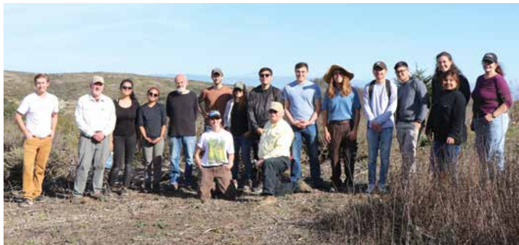
San Bruno Mountain Watch works to preserve and protect the Mountain in the City.

1701 Coyote Point Drive, San Mateo, CA 94401 650/321-5812 voice info@supportparks.org www.supportparks.org