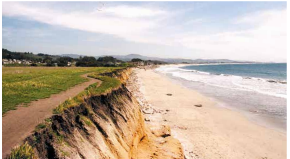
The Parks Foundation played a key role in acquiring Mirada Surf.