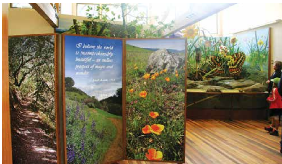
The Parks Foundation's largest project has been the Bill and Jean Lane Education Center at Edgewood Park and Preserve.

The Foundation's first office was at Flood Park in Menlo Park, and new playground equipment for Flood and other parks to meet newly mandated ADA requirements was among the Foundation's first fundraising priorities, as were shade shelters at Huddart Park,